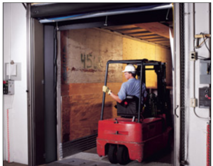
Loads can be fully accessed because nothing protrudes into the trailer opening.

Slim side frames make it possible to fit impactable Eliminator II shelters into spaces previously too tight for a dock shelter. Plus, you can avoid the expense of having to reposition lights, signs and electrical conduit before installing the shelters.