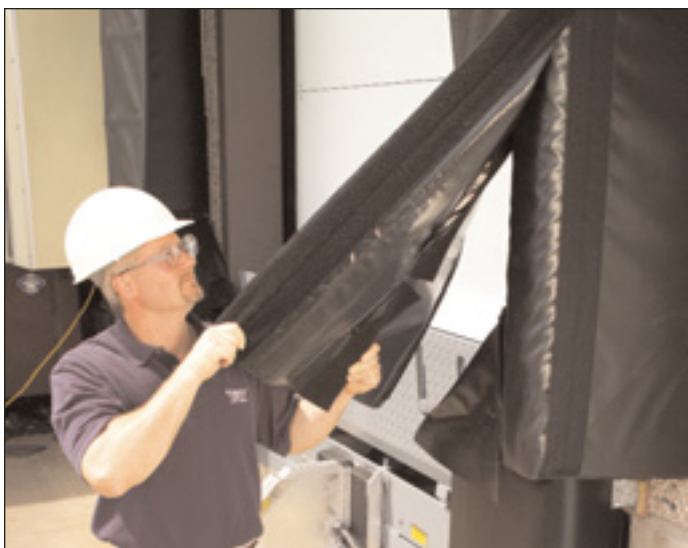
Removable side curtains are easy to detach and reattach. No bolts or other rigid attachment methods are utilized.

The original soft-sided ELIMINATOR shelter pioneered the concept of impactable shelters. It can withstand the impact of off-center trailers, is effective in virtually any dock application, accommodates a wide range of trailers, and allows trucks to handle loads without interference. Side curtains fasten on with Velcro® and can be replaced in seconds. Or take them down in summer to reduce wear and ventilate your dock. Exclusive collapsible draft pads provide a tight seal at the lower corners. Adjustable C-style head curtain allows for varying trailer heights.