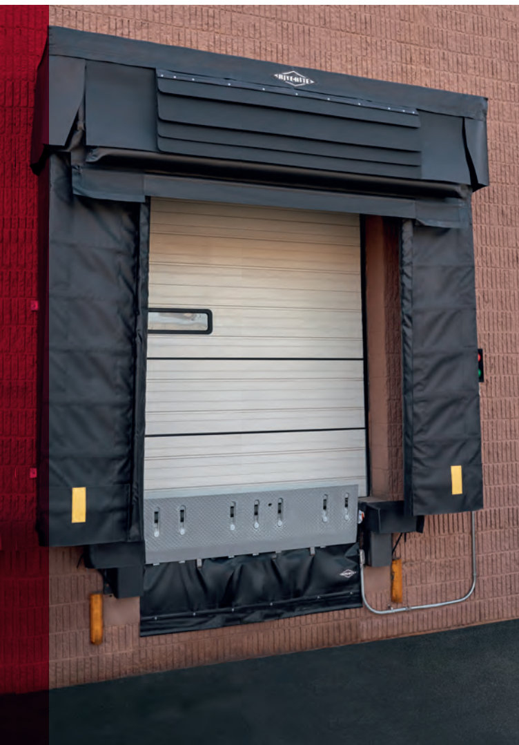
Rite-Hite® Eclipse Dock Shelter.