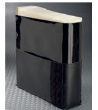
Poly-wrapped side frame.